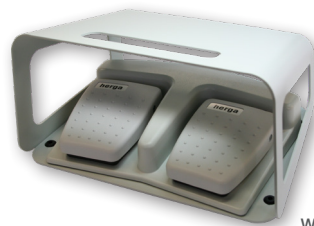
With 6202 Guard