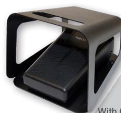
With 6202 Guard