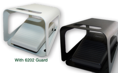
With 6202 Guard